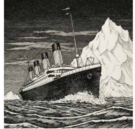
Drawing of Titanic scraping the iceberg

The iceberg scraped along the starboard side, popping rivets and opening seams below the waterline over a length of nearly 300 feet.