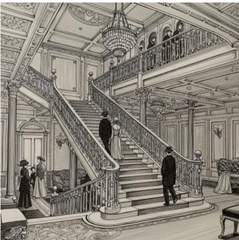
Artist's drawing of inside the Titanic

When the Titanic left Southampton, England on April 10, 1912, it carried people from all walks of life: