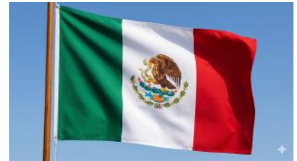
Flag of Mexico